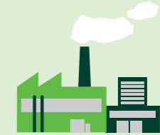
Total manufacturers, retailers and other industry stewards registered with EPRA Manitoba.