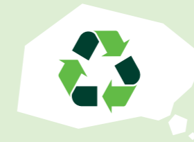
Percentage of the population aware of the e-recycling program.