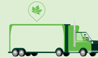
Collection Site Coverage and Convenience.

Measures related to the convenience of accessing the program to have regulated electronics recycled.