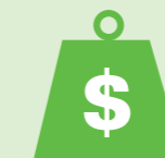
Total program cost per tonne.

This scorecard lists the harmonized Key Performance Indicators (KPI) which EPRA's regulated, industry-led electronics stewardship programs operating in 2025 in Canada have committed to report on, as per "Research and Recommendations for Performance Measures For Regulated, Industry-Led, End-of-Life Electronics Recycling Programs in Canada" (Intergroup Consultants Ltd, April 2010). These measures reflect data which is presented in each program's annual report and/or other public reporting.