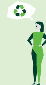
Public Awareness and Industry Participation.

Measures related to the public's awareness of the program and the participation of obligated industry stewards in the program for environmental regulatory compliance.