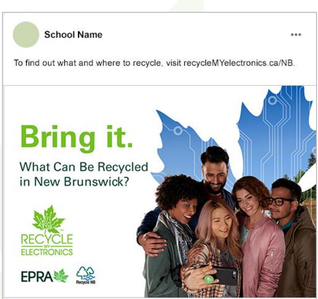
Template: What Can Be Recycled