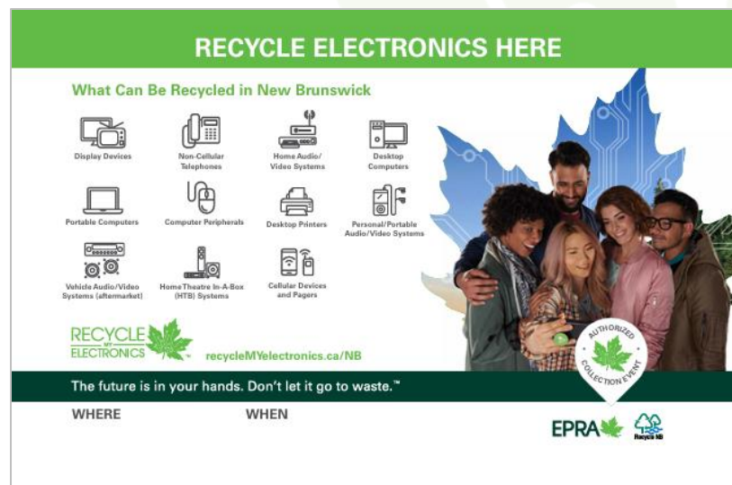
Postcard: What Can Be Recycled