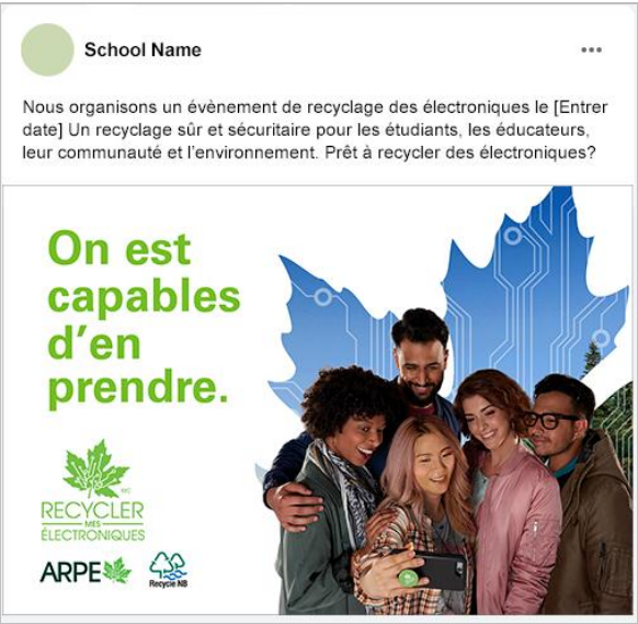
Template: Bring It

Add information and use these templates to inform the school community about the collection event.