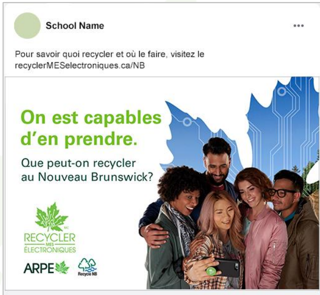
Template: What Can Be Recycled