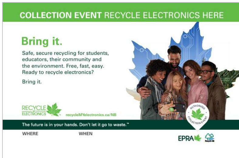
Postcard : Bring It